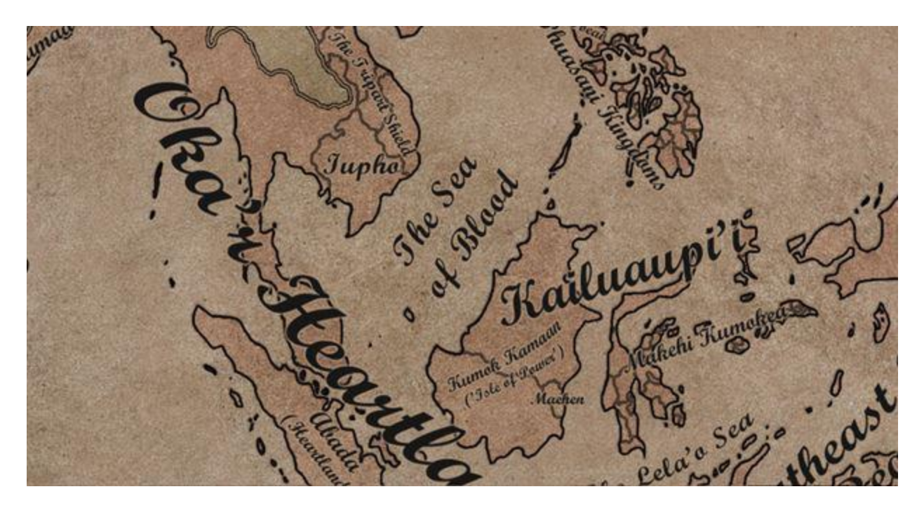
The Sea of Blood, with post-war borders.

SEA OF BLOOD - A sea between the mainland and the islands on which the Oka'r originated. By the end of the war with the Oka'r much of the mainland coast had been conquered.