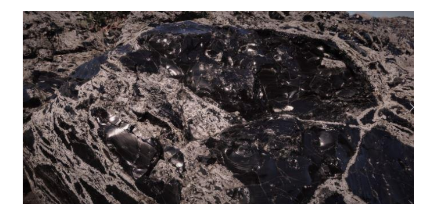
A cliff face composed largely of obsidian, formed millennia ago by Rouub's attack on the garden-realm.

GLASSCRAG — /'Glas-krag/ — So hot was the fire of Rouub's wrath at Qalhanna-Laugī that some of the stone itself melted under her assault. Some of this molten rock quickly cooled to form volcanic glass cliff faces and tracts of unbroken obsidian. In some rarer cases, where the trees were not burnt to ash, they were desiccated by the heat and fossilized to form similar-looking cliffs called jetscarps.