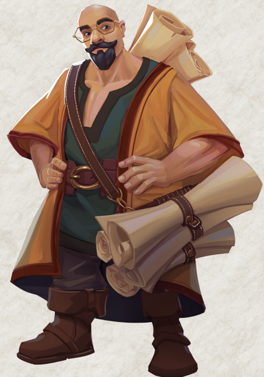
The late Markos Beornhardt, Master Architect of Bharzul

Treasure: High Thane's Chest. The chest in this room is locked, and can be opened with a DC 20 Dexterity check using thieves' tools. Inside is a ceremonial robe, a bejewelled, ancestral hand-axe worth 100 gp, a personal ledger containing the High Thane's notes on council proceedings and other realities of rulership (which may be valuable to a rival politician as insight on the High Thane), a signet ring, and a prayer relic.