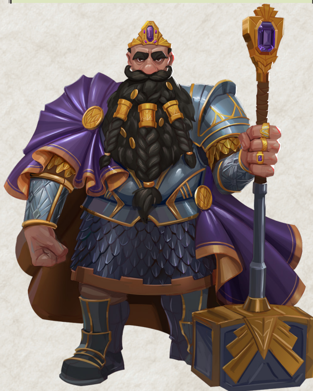
High Thane Lodbrook VII in his battle regalia.

Grand tapestries hang from the walls of this stately chamber. At the far end of the room, a pair of double doors are ajar, revealing a small, studious space beyond. At the center of this space is a large desk scattered with papers, quills and tomes, in front of a bookshelf running the length of the wall behind it. A hulking figure of iron