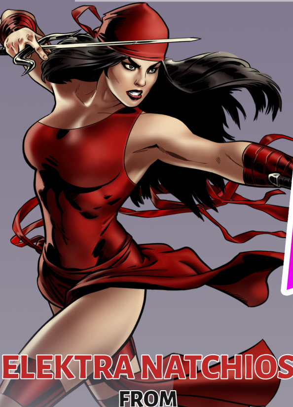
ELEKTRA NATCHIOS FROM

To keep Wedgie Warriors in line with the theme of this issue, we decided to make this issue's fight all about ninjas! This time we have a manga character vs a comic book character, and although both are pretty sneaky and dangerous ninjas in their original works, only one can leave with their underwear unscratched!