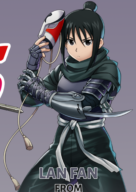
LAN FAN FROM FULLMETAL ALCHEMIST