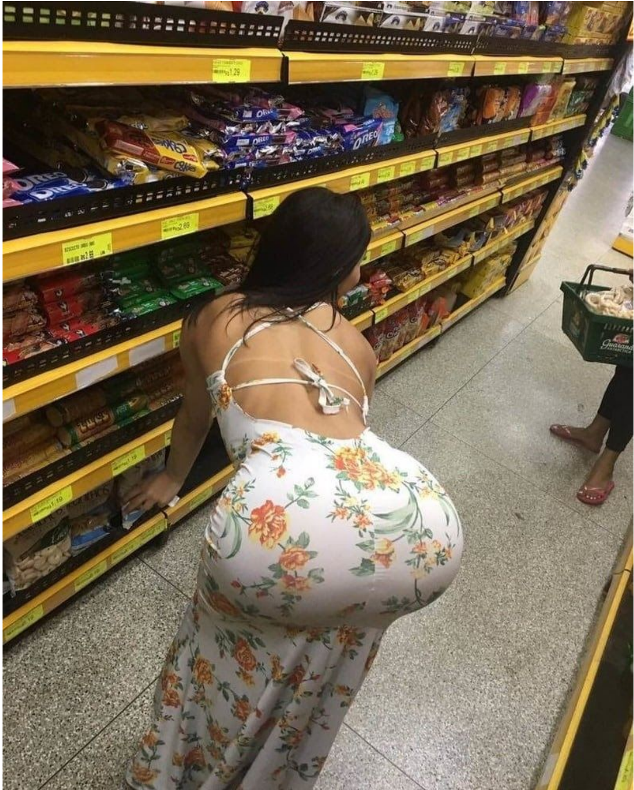
Serena bent over, her MASSIVE ass sticking out towards Jake as he began blushing a deep red.